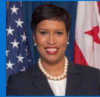
Muriel Bowser Mayor The District of Columbia