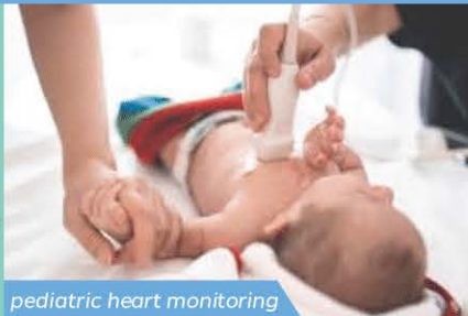
pediatric heart monitoring