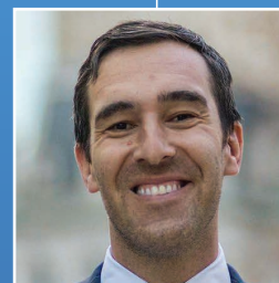
Zeke Cohen Baltimore City Councilman, 1st District

Watch it LIVE on @JHHEATCorps or @JHConnects!